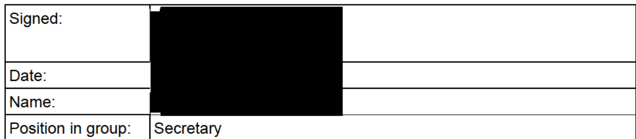
Table 6 Declaration

Return to Macclesfield Town Council, Macclesfield Town Hall, Macclesfield SK10 1EA